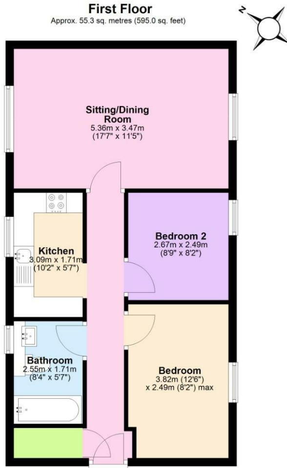
Total area: approx. 55.3 sq. metres (595.0 sq. feet) Flat 2 Dapps Hill, Keynsham